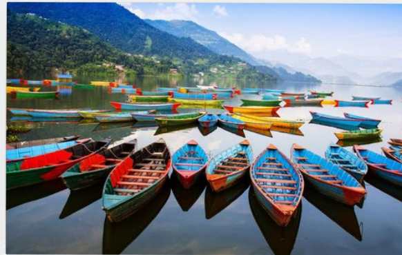
PHEWA TAL LAKE

Indulge in the tranquility of Phewa Tal Lake, Nepal's picturesque gem. Located in the captivating city of Pokhara, this serene lake is a haven of natural beauty and calm. Gaze at the mirror-like waters reflecting the majestic Annapurna mountain range, while colorful boats gently glide across the surface. Immerse yourself in the peaceful ambiance, surrounded by lush forests and blooming flora. Take a serene boat ride, watch the sunset paint the sky with hues of gold, and find solace in the beauty of nature. Let the serenity of Phewa Tal Lake captivate your soul and inspire you to embark on a journey of tranquility and rejuvenation. Travel to Phewa Tal Lake and discover a world of breathtaking beauty that will leave you in awe.